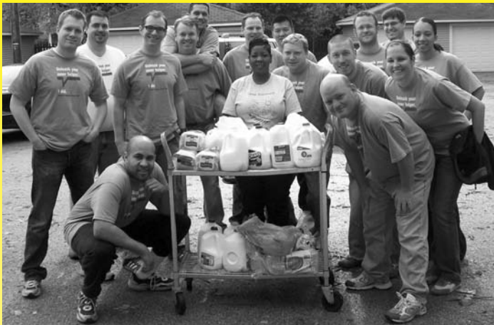
Corporate partner, Charles Schwab, spends a day sprucing up the grounds of Dayspring Center.

Dayspring Center is thankful for the many corporations, civic groups and faith-based organizations that help us provide for families in need. Here are just a few of our community partners that have donated their time, service and resources to improve the lives of Indy’s homeless families and their children: