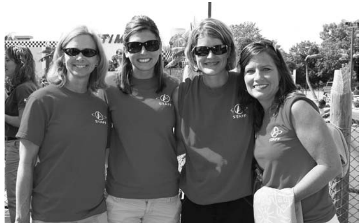
Foursome — Interactive Academy – places second in Corporate competition