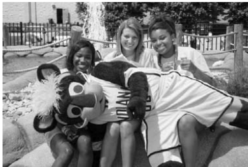
"Boomer" and Mini-Golf Classic Volunteers

with a baseball bat, a pool cue and a hockey stick. Corporate Hole Sponsor, Foamcraft, Inc. brought in the lowest score for a tournament team to take home the sought-after, one-of-kind Mini-Golf trophy and win a complimentary foursome to The Hawthorns Country Club. Family teams competed for popular family entertainment packages. The Butler Bulldog mascot, Chick-fil-A cow and Boomer