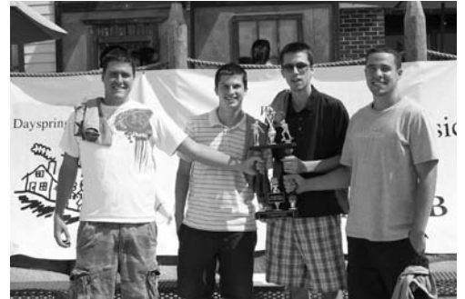
Foamcraft foursome takes home winning trophy.

Where do you go to see the Chick-fil-A Cow chase a Dayspring staff person across a putting green, a 3-year old boy land a "hole-in-one", and players of all ages putt with a pool cue? Only at the Dayspring Mini-Golf Classic! On June 6 th , over 55 family and corporate teams gathered at Pirates Cove, next to Woodland Bowl, to compete in a miniature golf tournament unlike any amateur or pro putter has ever experienced! While families took on the wacky antics of putting blindfolded or on their knees, the corporate teams competed on a separate course putting