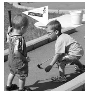
An event for all ages.